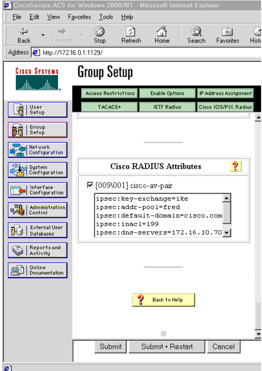
Figure 1 IETF RADIUS Attributes Selection for Group Configuration

In addition to the compulsory attributes shown in Figure 1 , other values can be entered that represent the group policy that is pushed to the remote client via Mode Configuration. Figure 2 shows an example of a group policy. All attributes are optional except the Addr-Pool attribute. The values of the attributes are the same as the setting that is used if the policy is defined locally on the router rather than in a RADIUS server. (These values are explained in the section “ Defining Group Policy Information for Mode Configuration Push ” later in this document.)