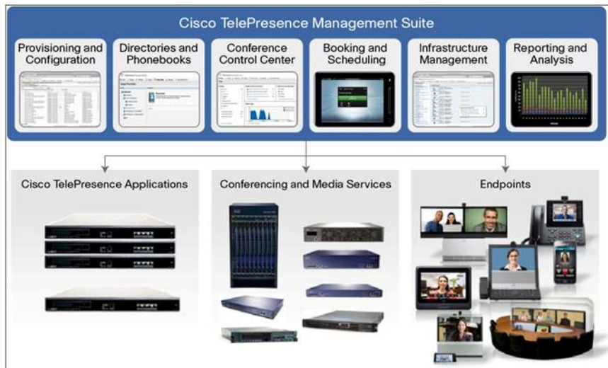
Figure 1. Cisco TelePresence Management Suite

With Cisco TMS (Figure 2), network administration is simplified through powerful scheduling, configuration, and provisioning capabilities, making Cisco TMS vital to any telepresence deployment. Cisco TMS integrates phone books with various external information sources and existing directories. It allows you to schedule meetings quickly and easily, enabling effective collaboration while providing scalable, multivendor infrastructure support across the telepresence network. It also delivers a comprehensive set of usage and activity reports for informed business decisions.