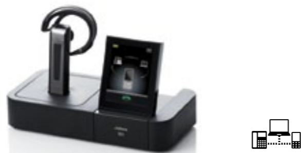
Image shows the Jabra GO™ 6470 with base station and touch screen.