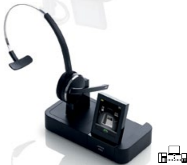
Image shows the Jabra PRO™ 9470 with dual microphone Noise Blackout technology.